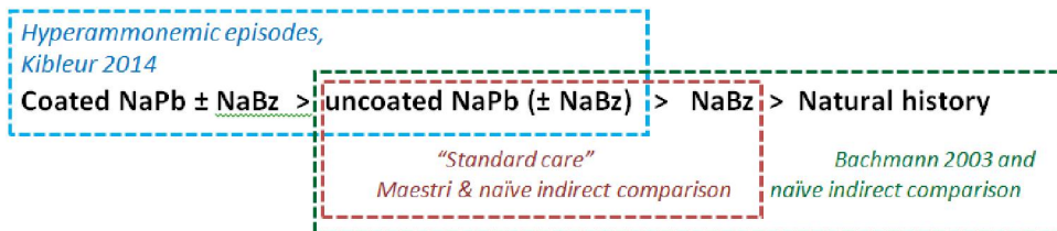
Figure 1: Comparisons presented in the submission