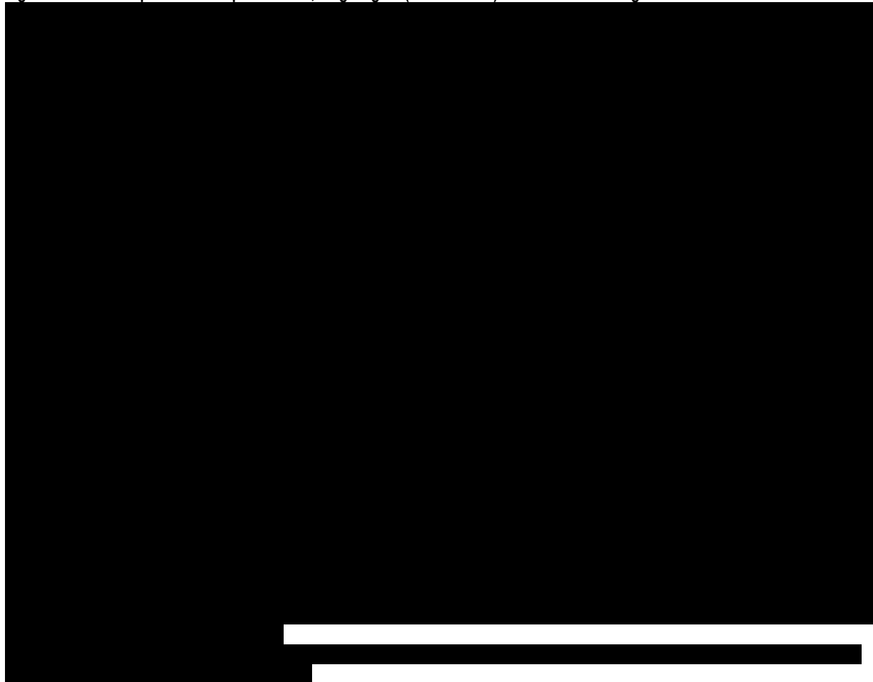
Figure 2: Overall response rate to pralatrexate, single agent (brentuximab) and combination regimens

The redacted figure above shows the primary measurement for the overall response rate for pralatrexate was 29% (95% CI 21, 39%) which was compare with brentuximab, gemcitabine, DHAP, ESHAP, ICE and mixed pool analysis.